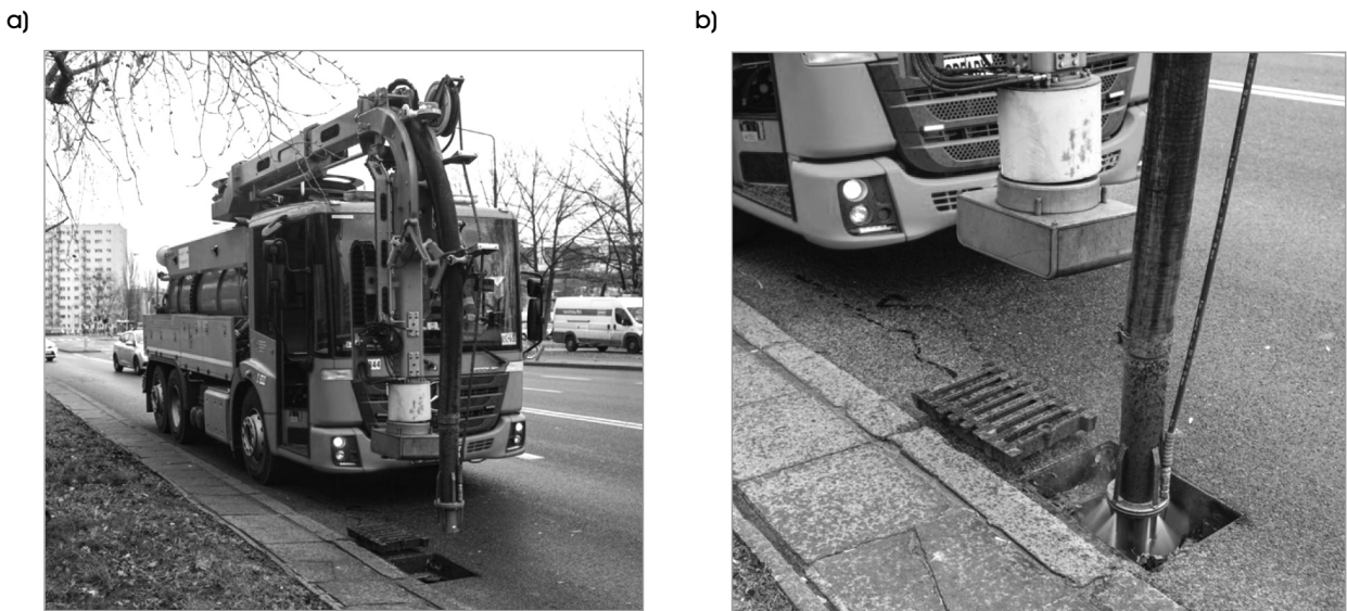
Figure 4 A specialist truck for cleaning the sewage system, FFG Elephant type: (a) general view, (b) sewage collector cleaning