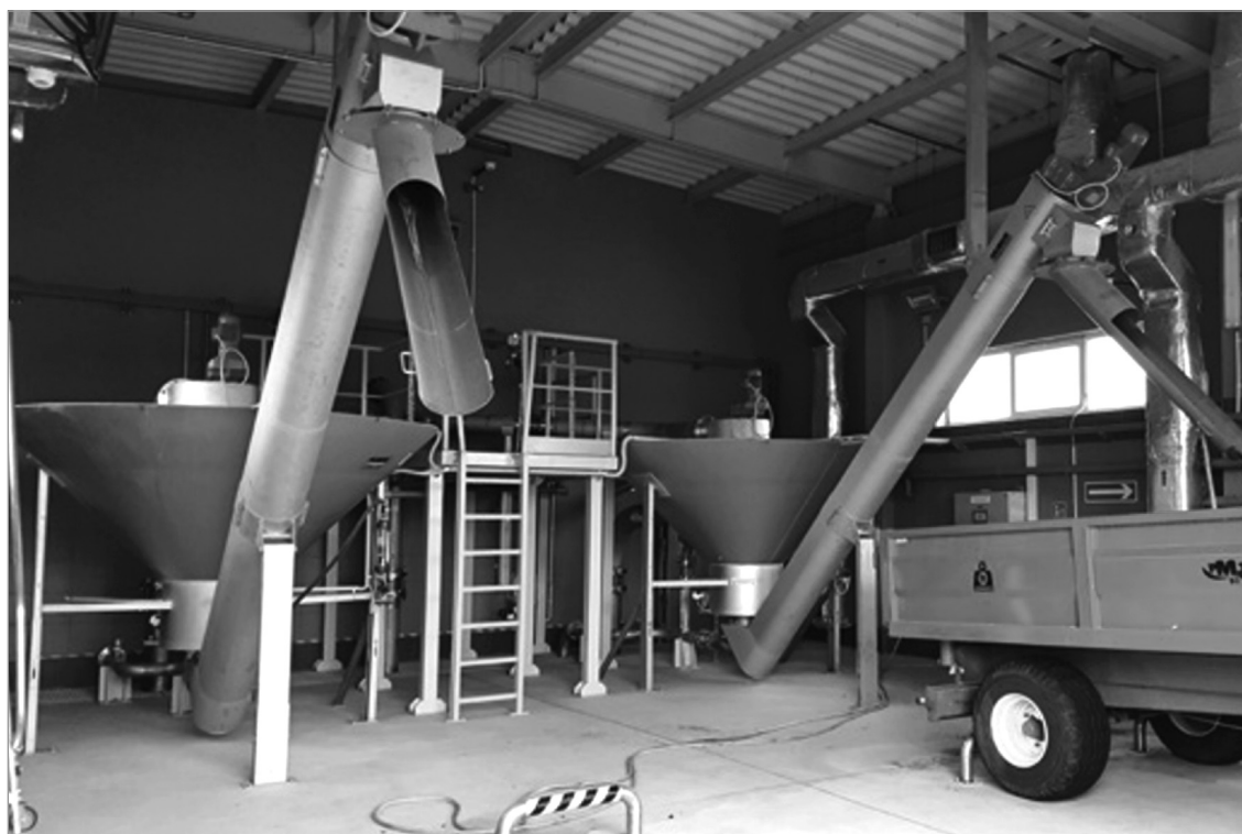
Figure 3 Sand separator nodes