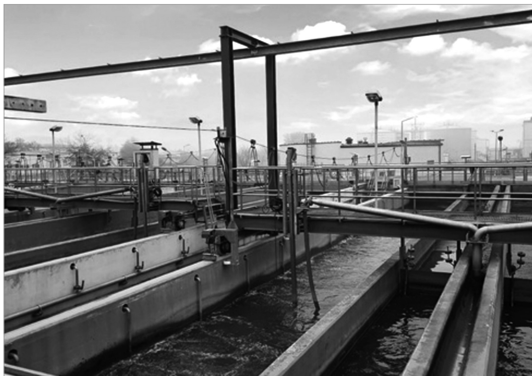
Figure 2 Grit chambers

In many wastewater treatment plants, the sand recovery system is modernized with sand separator nodes (Figure 3). The purpose of using such nodes is to receive contaminated sand pulp from grit chambers, to rinse and separate organic and mineral parts. This solution improves the final parameters of sandy waste, minimizing or practically completely removing the odour from the waste, reducing the content of organic substances in the waste (even to a level below 2%) and reducing the hydration of the waste. With the use of such systems, the waste from the sand separators is discharged to a storage tank or a place of temporary storage (Biedrzycka, 2021; Szulc, 2018). Considering application of sandy waste recovered in wastewater treatment plants in construction, it